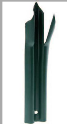
W Pale Triple Point

For more information about Palisade fencing please contact our sales team